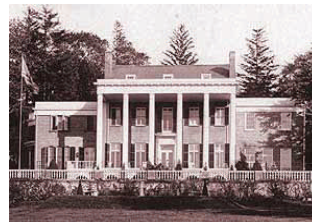
PRES WHITE AGENCY